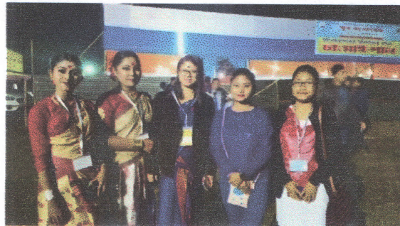
Participation of students in the Inter- college Youth Festival of Dibrugarh University