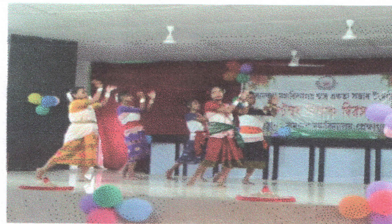
Cultural activities in the Collage premises by the students