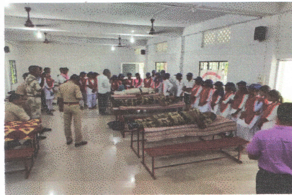
Blood Donation by Volunteers during Mega Blood Donation & Awareness Camp