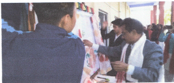
Wall magazine Competition