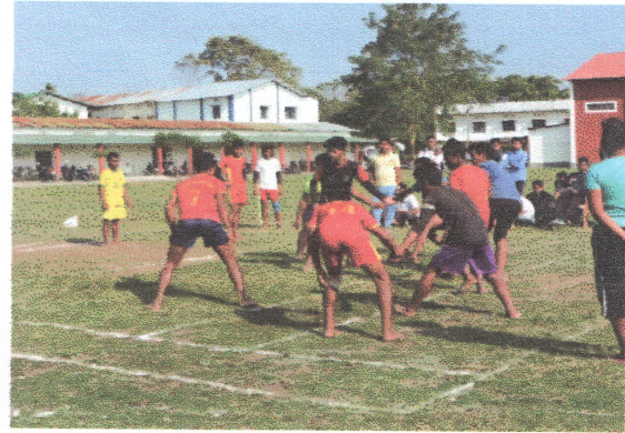
Sports activities in the college