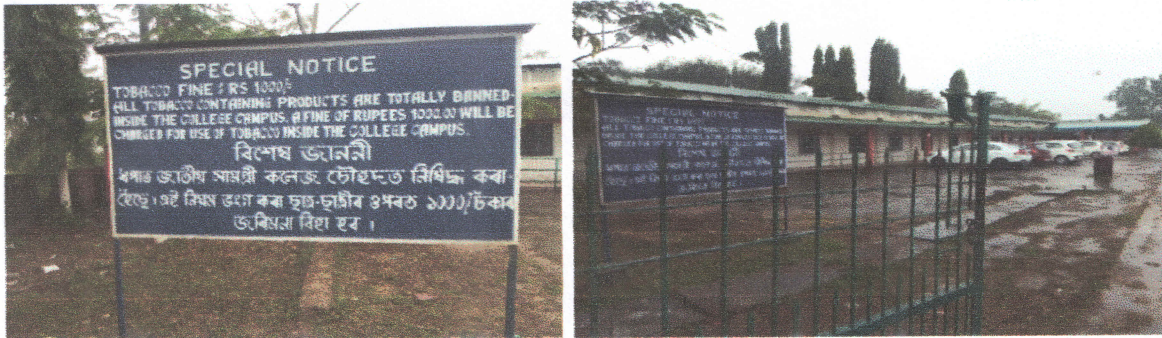
Special Notice given by the college to prohibit tobacco use inside the college campus