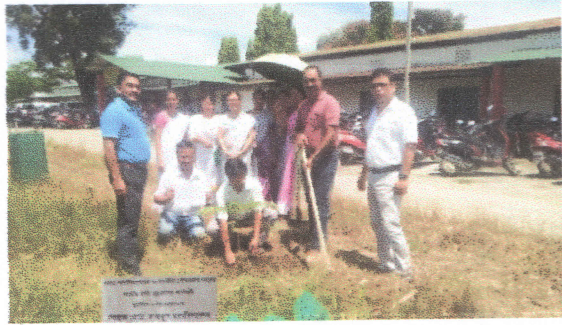
Sampling plantation by the faculty members