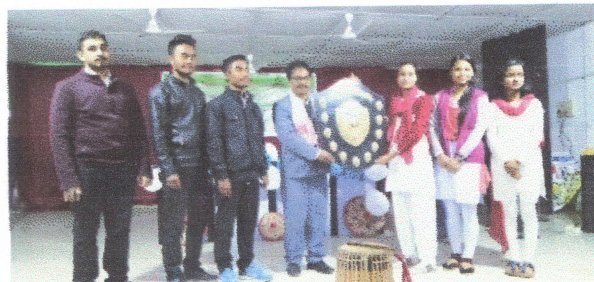
Prize distribution of Wall Magazine Competition