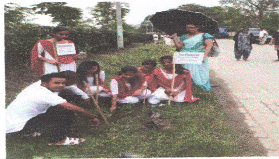
Sampling plantation by the students