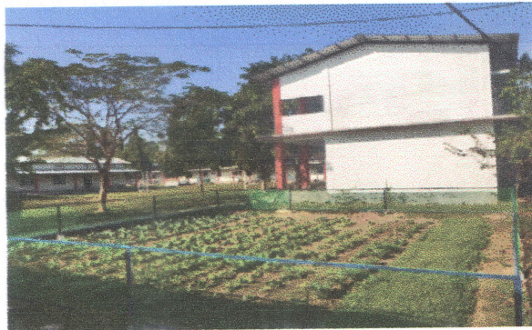
Cultivation at the college premises