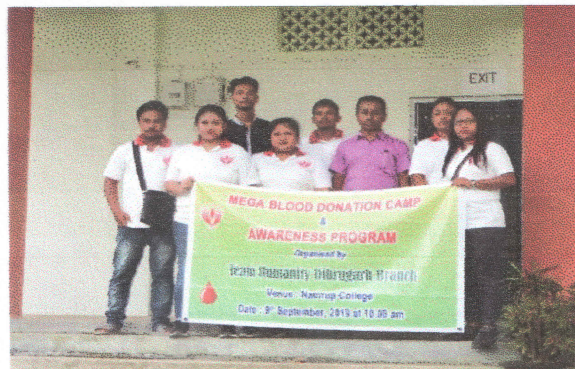
Mega Blood Donation Camp & Awareness programme