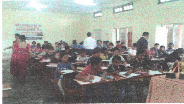
Drawing Competition on World No Tobacco Day