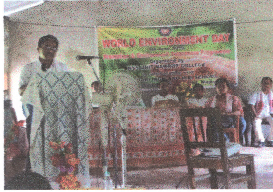
World Environment Day celebrated by the College in the adopted village