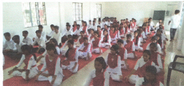
International Yoga Day celebrated by the College