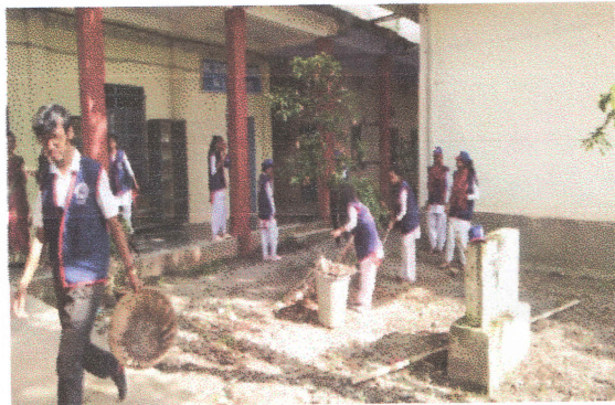
Swachh Bharat Abhivan by the NSS unit, Namrup College