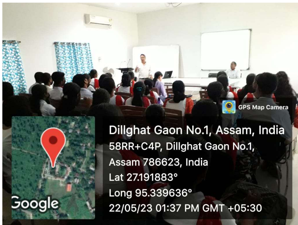
Students and Teacher were attended the programme